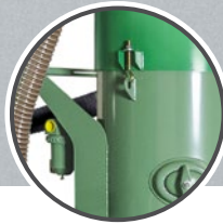
CONTRACOR Z-200 BLAST POT

mounted directly on the Contracor Z-200 series blast pot.